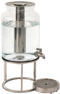
Tilt Juice Dispenser and Drip Tray