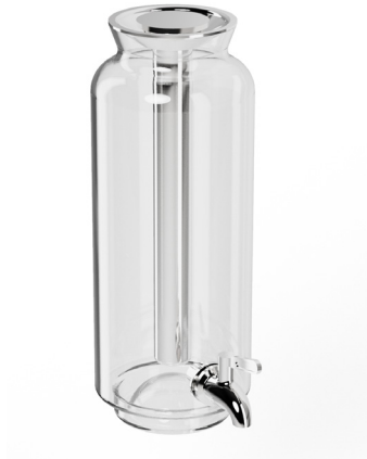
Tilt Mini Juice Dispenser and Triple Drip Tray